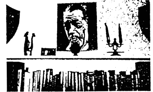
Duke's picture above the mantle in Stanley's music room